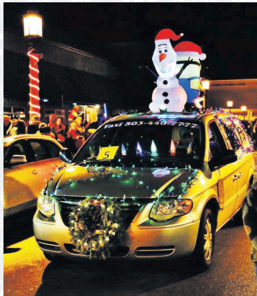
The Parade of Lights in downtown Seaside is a community event put on by the Chamber of Commerce and sponsored by Pacific Power.