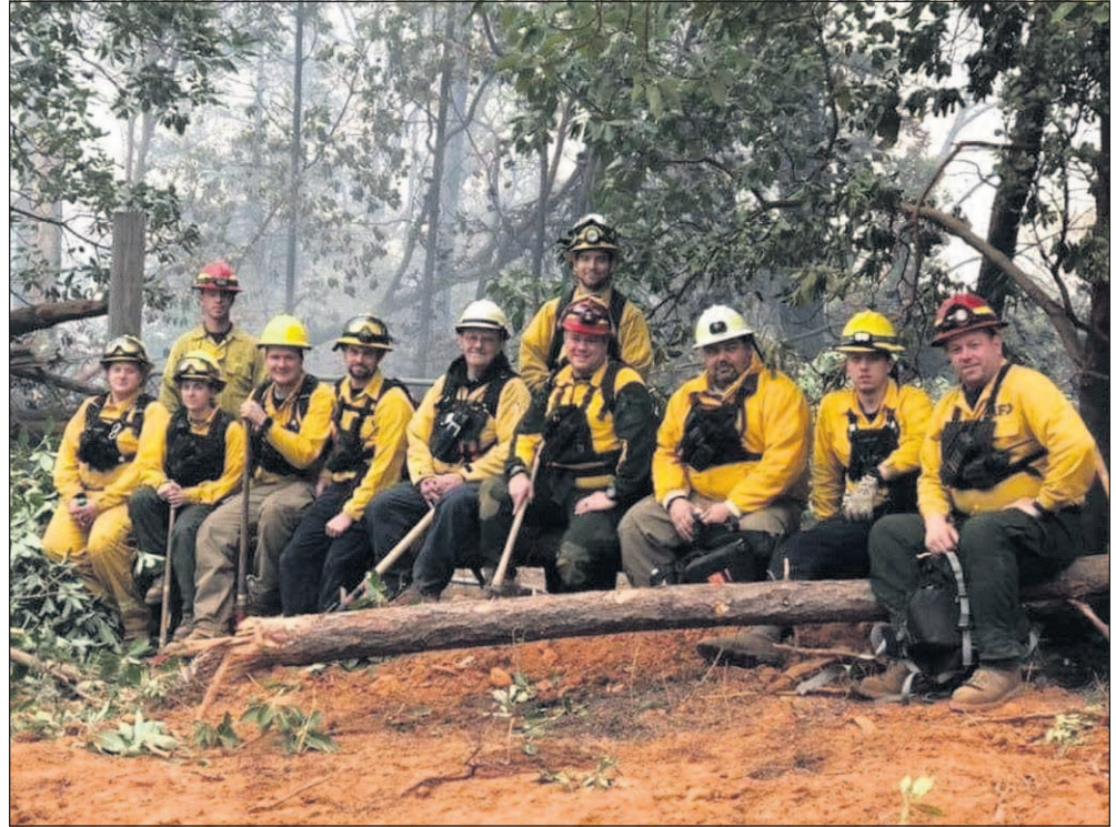
Seaside Fire and Rescue