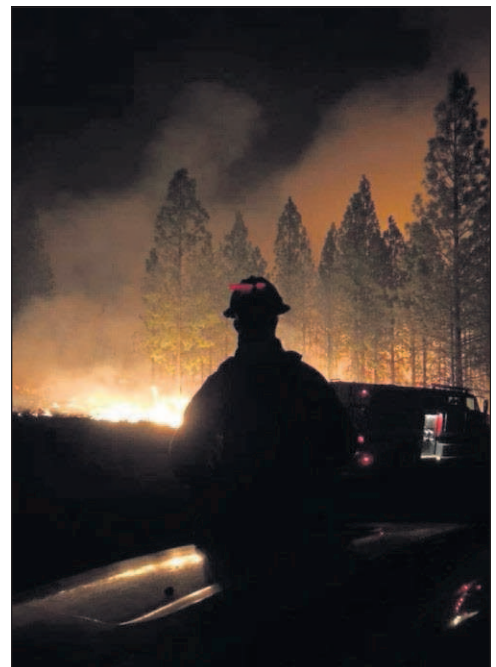
Gearhart Fire Department At the Camp Fire near Chico, California.

The fire started Nov. 8, in Butte County near the northern California city of Paradise. After a request from California officials and Oregon Emergency Management, county strike teams headed south as part of the Emergency Man-