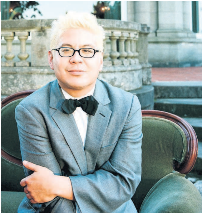
Pianist Thomas Lauderdale

derdale will also play solo works as well.