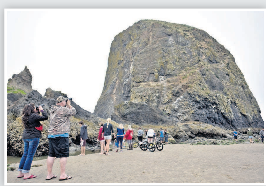
Haystack Rock is the site of nesting grounds for several endangered bird species.

'WE REALLY WANTED TO LEARN ABOUT WHY VISITORS CAME HERE. WE WANTED TO ASK THEM WHO THEY ARE AND FIGURE OUT HOW WELL WE WERE EDUCATING THEM. SO WE CAN LEARN HOW TO BETTER ENGAGE WITH THEM.'