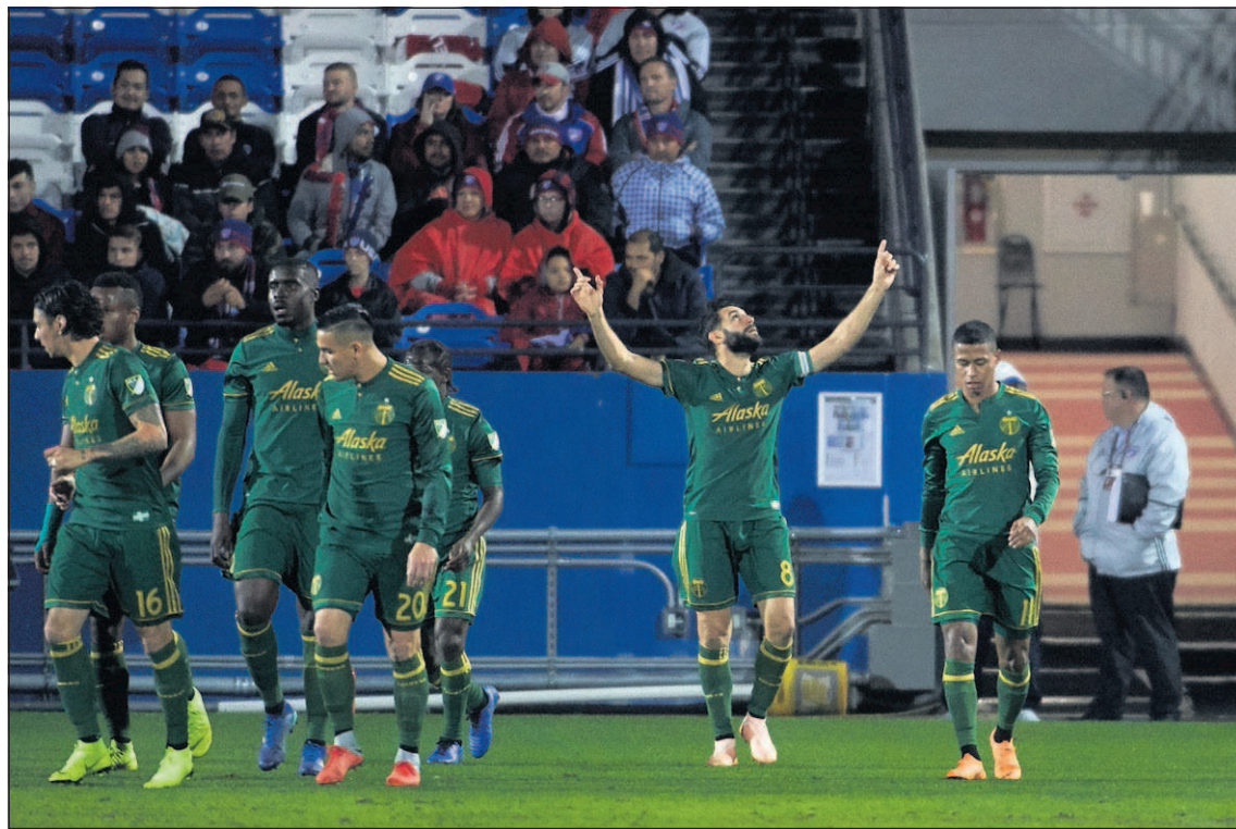
Portland Timbers midfielder Diego Valeri (8) celebrates after scoring a goal against FC Dallas during Wednesday's playoff match in Frisco, Texas.

Boys soccer — North Marion at Seaside, 5 p.m.