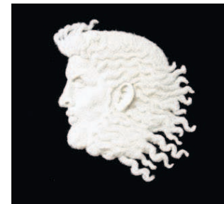
Textile art of Poseidon.

The show is sponsored by the fabric store Center Diamond, which has been