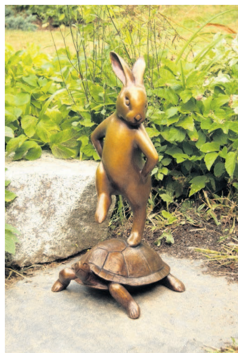
'Pond Dance,' a sculpture by Georgia Gerber.