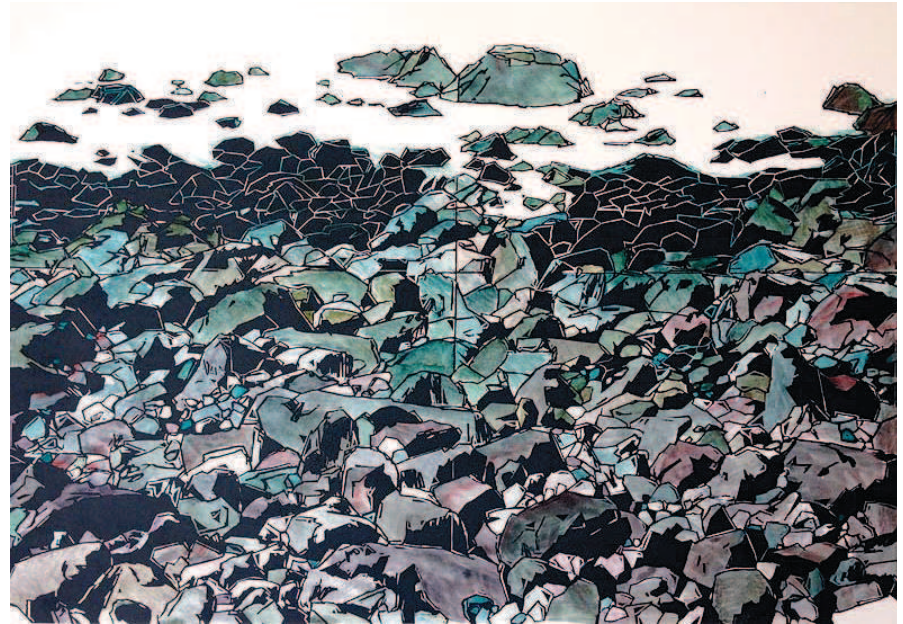
Ancient Rhythm by Stirling Gorsuch

View more talented artists at www.whitebirdgallery.com .