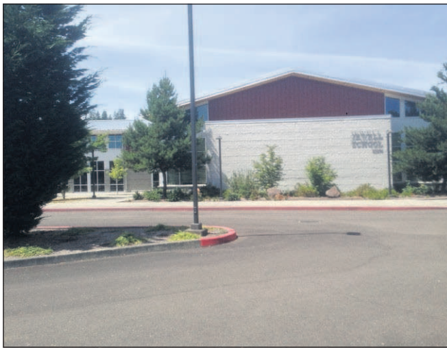
The Jewell School District will get a health center.

JEWELL — In a split vote, the Jewell School Board on Monday night accepted a grant to start a school-based health center.