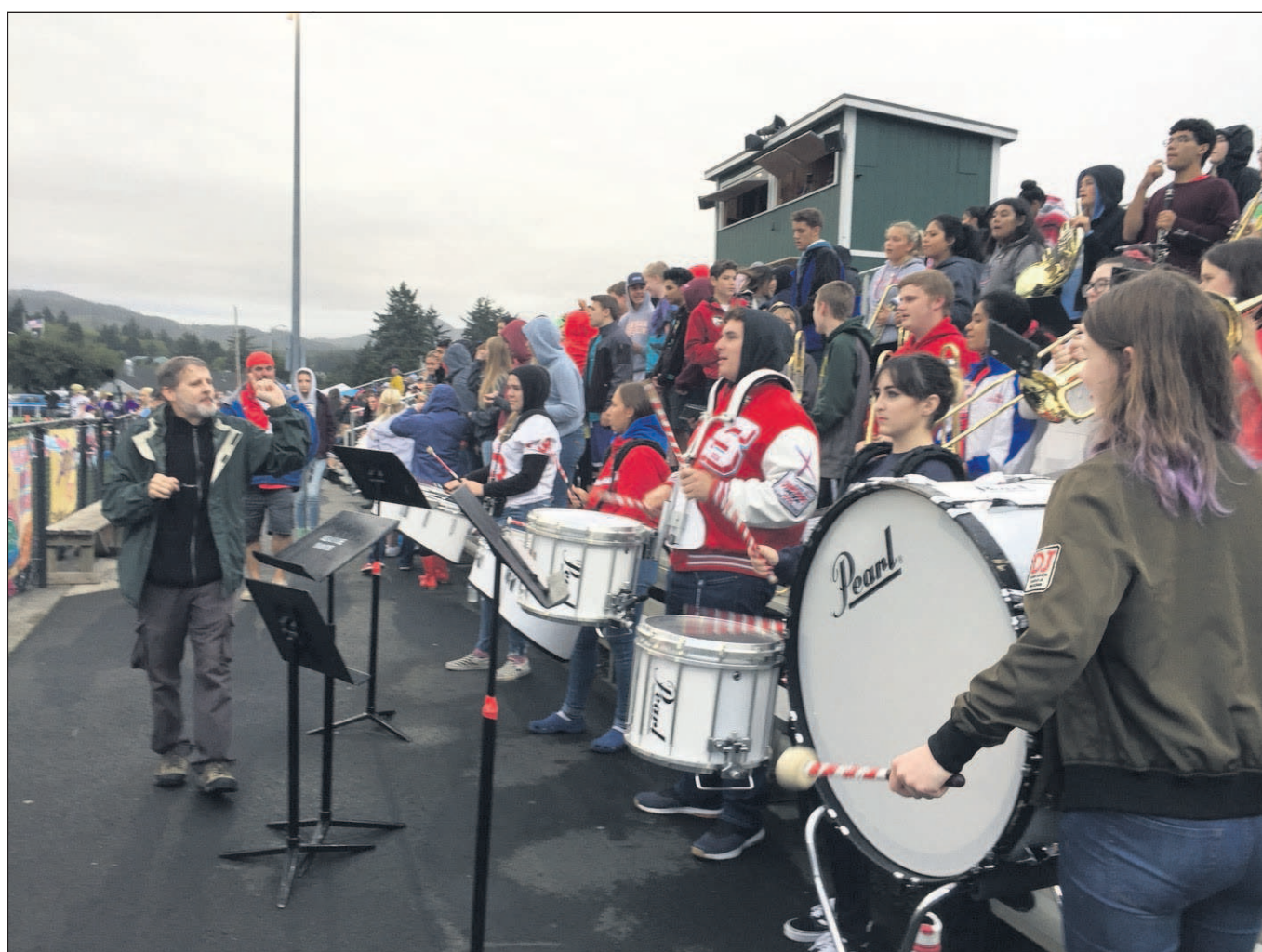
The Seaside High School band provides a soundtrack for the Gulls' winning ways.

Athletes play both offense and defense, a challenge that would quickly exhaust anyone older than 18.