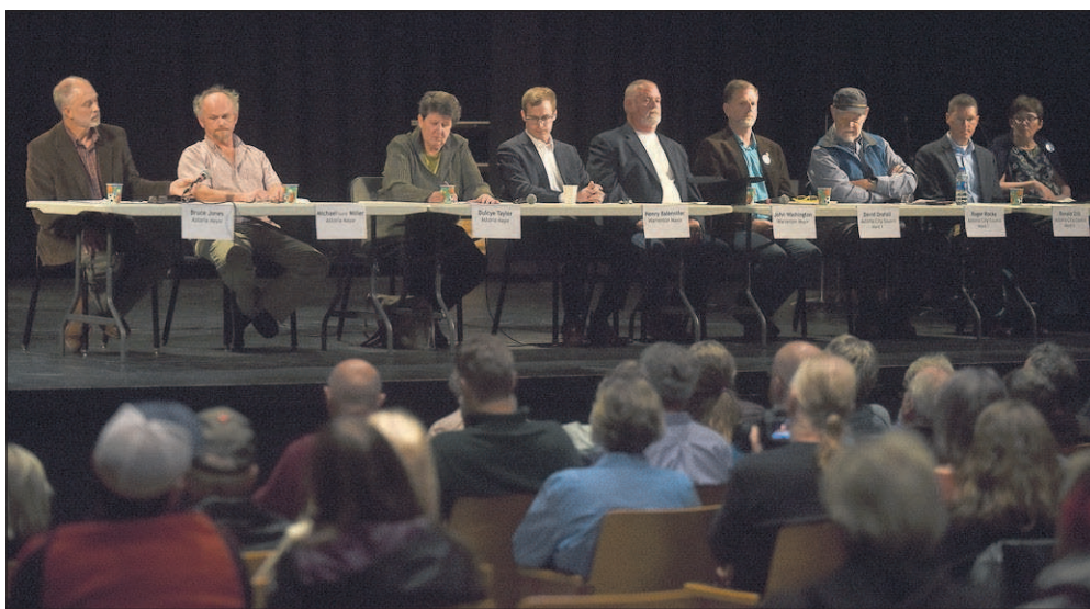
Candidates participate in a forum at Astoria High School.

The nine candidates were asked which bonds on the November ballot most benefit the communities they represent: a $70 million bond to modernize and improve the Astoria School District's buildings; a $38.5 million bond to