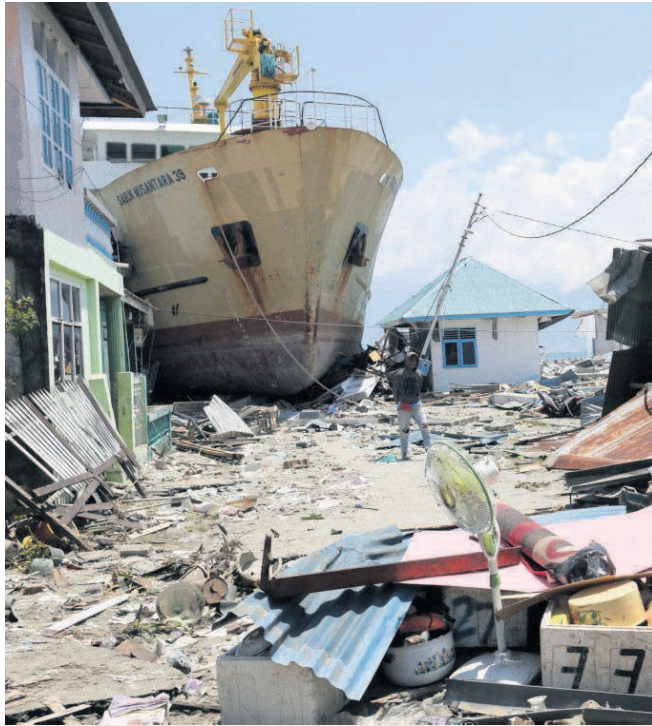
A ship was swept ashore during Friday’s tsunami at a neighborhood in Donggala, Central Sulawesi, Indonesia.

The first lady saw how babies are weighed — they’re placed in sacks that are then hung from a hook attached to a scale. She also watched a nurse demonstrate how vitamins are administered to babies by mouth and toured the neonatal