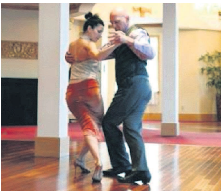
Cascadia Chamber Opera

* The Beatniks , rock, 5 p.m., City Park, next to Visitors Center on Spruce St., Cannon Beach.