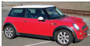
2005 Mini Cooper

5 speed, loads of fun, 160K miles, includes winter tires