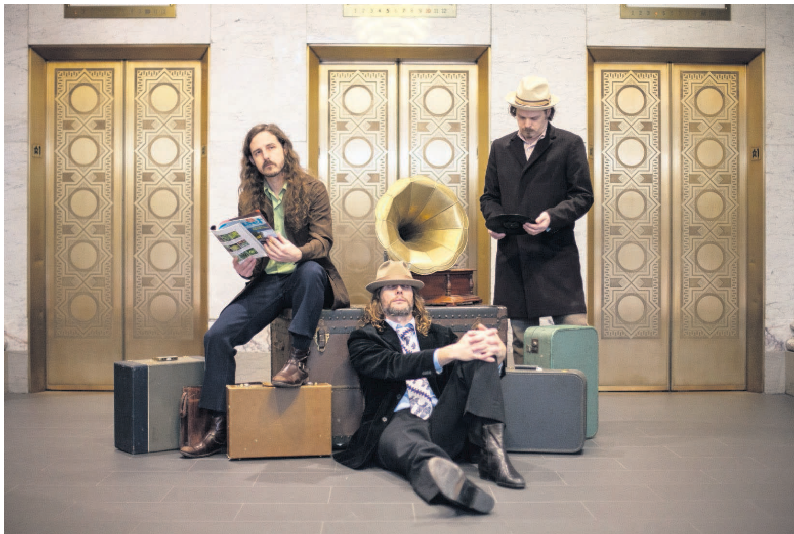
Modern roots rockers The Resolectrics.