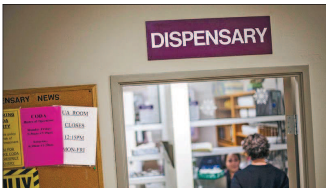
Pamplin Media Group