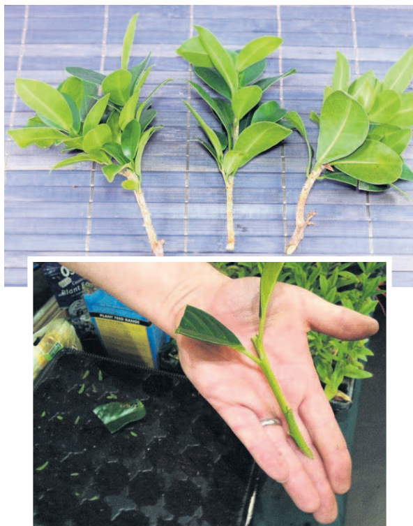
TOP: Ficus microcarpa. ABOVE: Laurel cuttings.