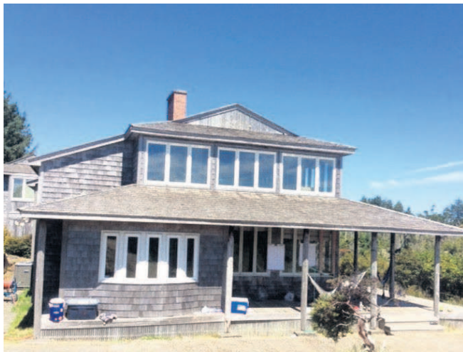
Norman Yeon House.