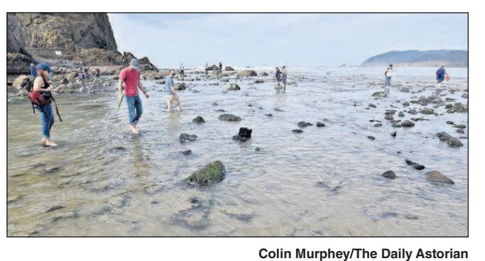
A health advisory was issued for Cannon Beach.

High readings in ocean waters can come from sources such as stormwater runoff, sewer overflows, failing septic systems, and animal waste