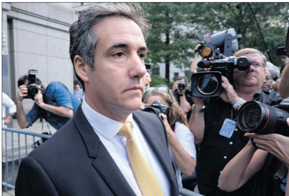
Michael Cohen, former personal lawyer to President Donald Trump, leaves federal court Tuesday after reaching a plea agreement.

Cohen initially denied making the payments