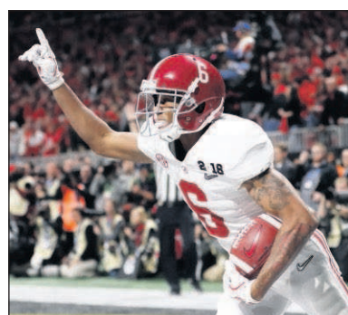
Alabama wide receiver DeVonta Smith celebrates his touchdown during overtime in the championship game against Georgia.

Ring up another milestone for coach Nick Saban's Tide dynasty. Alabama has won five national champi-