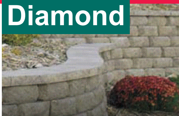
Diamond Gray Retaining Wall Blocks Build straight or curved retaining walls up to 4' tall. Nominal dimension 6" H x 15 7/8" W. X 12" D.