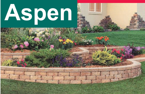
Aspen Stone Retaining Wall Blocks Choose from either Granite or Walnut Blend colored Aspen stone blocks to build a wall up to 2' tall. Each block is 4" T. x 12" W. x 7" D.