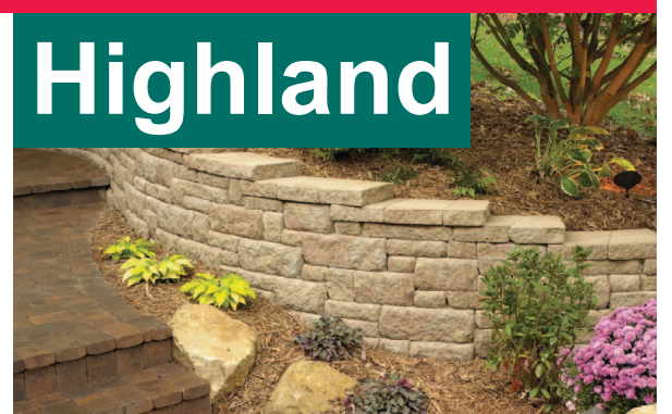
Highland Stone Retaining Wall Blocks Highland stone Walnut Blend multi-color face and variety of sizes contribute to the impression of a natural block wall. 6" T. blocks, 12" D. either 6", 12", or 18" W.

*Delivery for blocks available for extra charge.