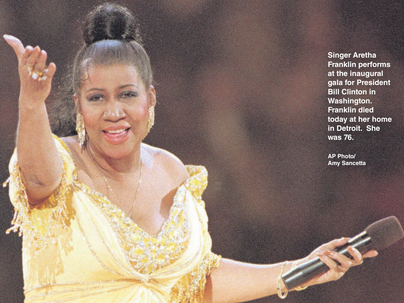
Singer Aretha Franklin performs at the inaugural gala for President Bill Clinton in Washington. Franklin died today at her home in Detroit. She was 76.