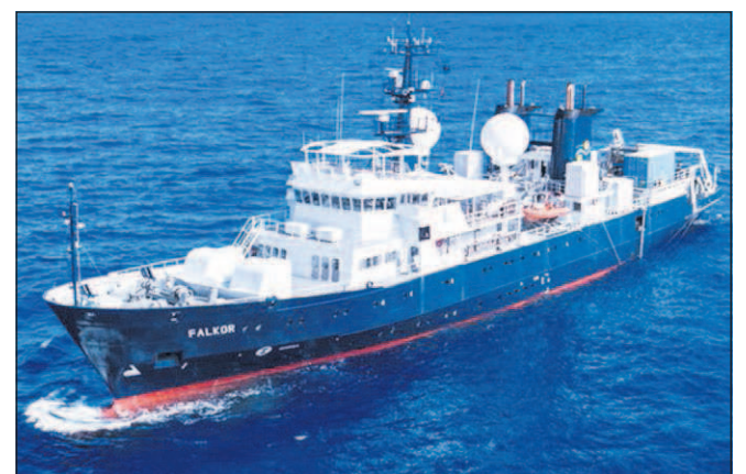
Schmidt Ocean Institute The research vessel Falkor is offering free tours Aug. 19.

The Falkor will leave Astoria Aug. 20 to look at methane gas seeps near Hydrate Ridge.