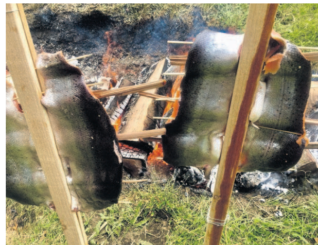
Tye (Chinook) salmon, filleted and staked and seared before an open fire pit.

The tribe carried it up the hill to the gathering place, and after more ceremony (the young people feed the slain Tye salmonberries) the fish was filleted, staked and seared before an open pit fire that radiated the warmth of the annual reunion. The fish was then shared with guests and with the Nation.