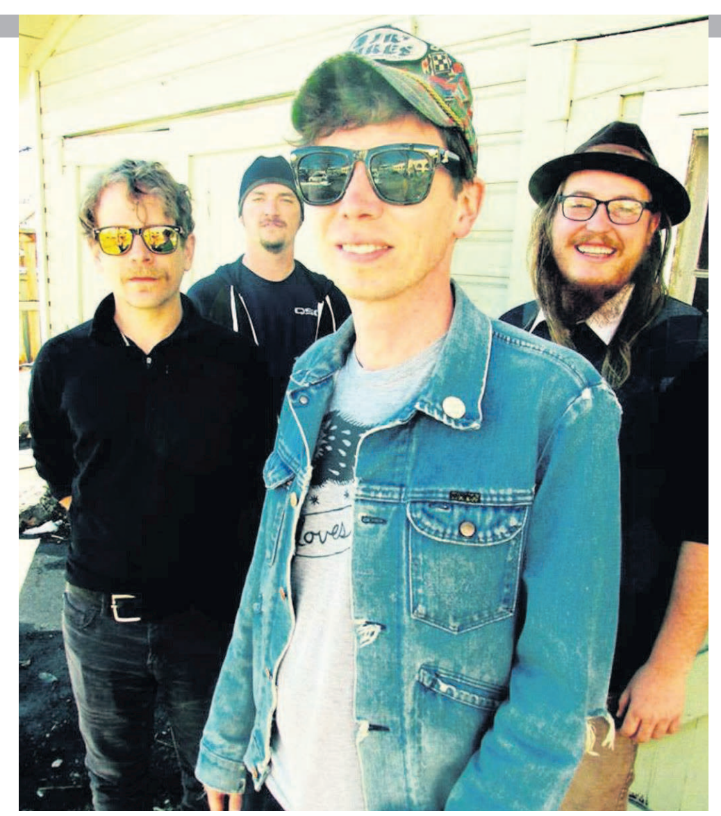
The Lonesome Heroes