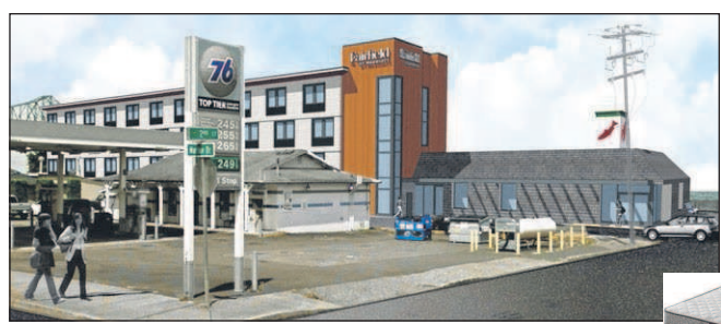
A developer is interested in building a new hotel on Astoria waterfront.

The developer was also criticized by members of both city boards for the state of the property where The Ship Inn and another former restaurant, Stephanie's Cabin, are located. Since Hollander Hospitality purchased the lots, the landscaping has become over-