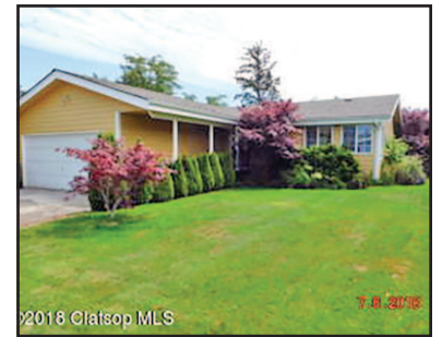
1100 NW Warrenton Dr. #338, Warrenton $69,000