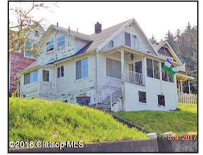
824 35th St., Astoria $255,000