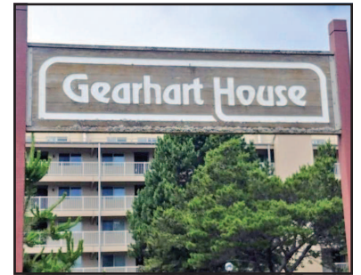
2-638 Gearhart House Condo, Gearhart $199,000