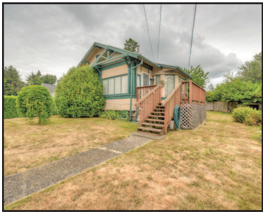
1832 6th St., Astoria $225,000