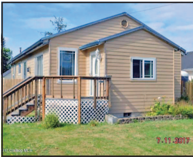
1095 Pacific Dr., Hammond $209,500