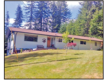
77071 Delena Mayger Rd., Clatskanie $375,000