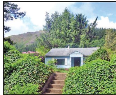
30210 Miami Foley Rd., Nehalem $89,900