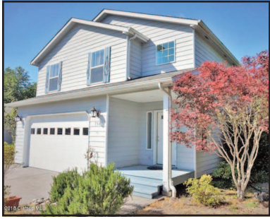
758 Kalmia Ave., Warrenton $325,000