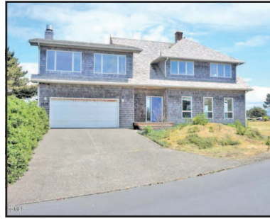
4545 High Ridge Rd., Gearhart $399,500