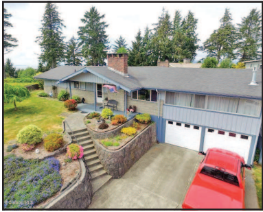
76 Skyline Ave., Astoria $485,000