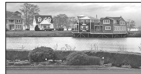
MILL POND WATER FRONT LOT Lot 12 Mill Pond Village, Astoria • $39,950

This building site has Mill Pond frontage and features views of the Pond, Village, Columbia River and Astoria Riverwalk. The site will require construction of a residence that is partially elevated over the water with pilings. Enjoy life on Astoria's waterfront.