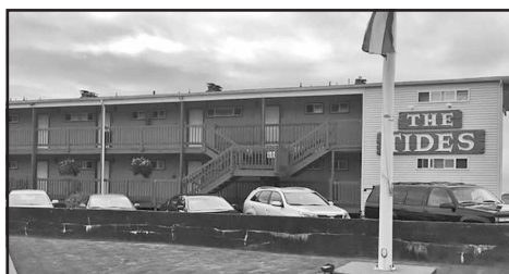
OCEANFRONT CONDO IN SEASIDE The Tides Condo #146, Seaside • $169,000

Two story commercial building with on street parking fronting Marine Drive and off-street parking at the back of the building. Commercially-zoned building with accessory unit. High profile location in east Astoria. Call listing broker for details. Currently operated as a pet grooming parlor. Business and equipment not being conveyed with the sale of the building.