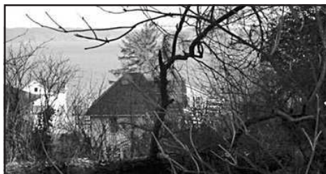
WEST HILLS COLUMBIA RIVER-VIEW LOT 1st & Exchange, Astoria • $50,000

.05 acre building site in Hammond (Ft. Stevens near parade grounds), east of Quinnat. Quiet location, short distance to Ocean Beaches and Ft. Stevens State park. Opportunity knocks!