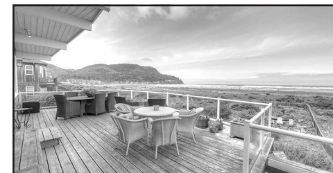
UNOBSTRUCTED MIGHTY PACIFIC VIEW 2380 Ocean Vista Dr., Seaside • $1,700,000

Enjoy coastal living in this well-cared for contemporary one-level ranch style home featuring an open floor plan, three bedrooms, two bathrooms, spacious attached garage and backyard patio, perfect for entertaining. Quiet dead-end residential street in west Warrenton, just a short distance to Ft. Stevens State Park.