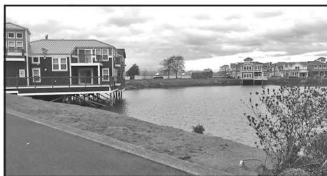
MILL POND WATER FRONT LOT Lot 11 Mill Pond Village, Astoria • $39,950

Exceptional commercial space with W. Marine Drive frontage and 11 designated off street parking spaces. The remodeled, versatile footprint offers room for expansion. This property has served as business headquarters/office space for a number of years and features large reception and staff area, meeting rooms, private offices, two half baths and a large kitchen/break room. So many possibilities!