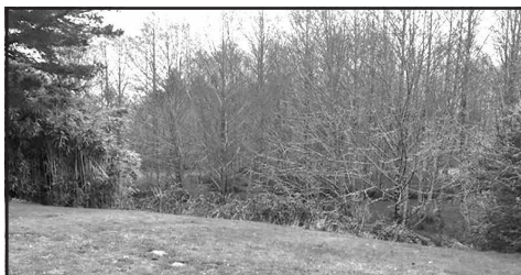
FORT STEVENS BUILDING SITE Quinnat adjacent, Hammond • $20,000

This building site has Mill Pond frontage and features views of the Pond, Village, Columbia River and Astoria Riverwalk. The site will require construction of a residence that is partially elevated over the water with pilings. Enjoy life on Astoria's waterfront