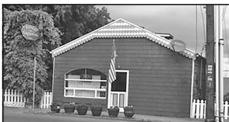
COMMERCIAL BUILDING 3162 Marine Dr., Astoria • $350,000

This exquisitely remodeled and immaculately cared for oceanfront home is truly the home of your dreams. This incredible home is situated on a large .23 acre footprint with fenced yard. Trail to the beach and backyard fire pit. High end designer finishes, old growth wood floors - light-filled rooms. Chef's kitchen with high-end finishes. Subzero, Thermador, built-in appliances, Quartz counters. Spacious living and dining, tall ceilings, multiple fireplaces - wood-burning and gas - inside and out. Master suite and second bedroom on Main. Two additional bedrooms on the lower level. Huge view deck. Hot tub! Sauna! Shop! Newer roof.