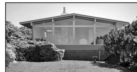
BREATHTAKING RIVER AND BAY VIEWS 420 W. Lexington, Astoria • $529,000

This fabulous renovated oceanfront condo in Seaside's The Tides condominium development has it all! Near the beach path, this one bedroom open floor plan unit has been in single family ownership for many years and has been lovingly cared for. Living/Dining area features a wood-burning fireplace. Furniture/most furnishings included. Pool. On-site management. Call listing broker for details and regarding pet policy.