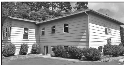
GREAT COMMERCIAL OPPORTUNITY 701 W. Marine Drive, Astoria • $349,000

Waiting for a spectacular home with an equally spectacular view of the Mighty Columbia River, Young's Bay AND Saddle Mountain? This fabulous contemporary-style, split-level home has been beautifully renovated and is in move-in ready condition. Large, open main level floor plan is perfect for entertaining and includes large living and dining room with fireplace and high ceilings, a light-filled kitchen, spacious master suite with private bath and large walk in closet and second full bath, and a private south-facing deck. The lower level features a large family room, two bedrooms and a third full bath. The oversized garage will fit two cars and toys.