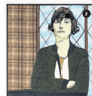
'Coco,' a stained glass mosaic and textile collage by Greta Latchford on display at McVarish Gallery.

anniversary, too, so stop by for some cheer!