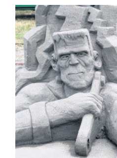
FILE PHOTO Sandsations Week

7:30 p.m., Coaster Theatre, 108 Hemlock St., Cannon Beach, 503-436-1242, $20 to $25, rated PG. "The Musical of Musicals: The Musical!" is an entertaining parody of musicals.