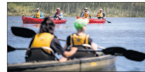
Canoeers hit the waters of Lewis and Clark River from Netul Landing.