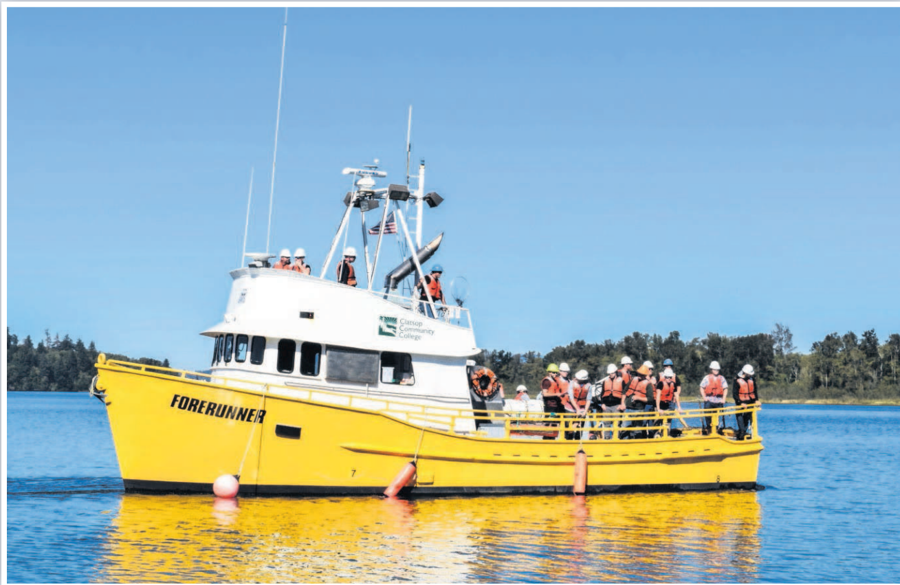
Clatsop Community College

Clatsop Community College is hoping to expand its maritime science program in response to a growing demand for workers in the industry.