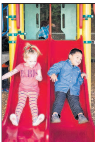
A study found a significant number of children on the North Coast miss out on preschool.