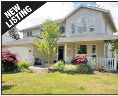
36430 River Point Dr., Astoria $425,000