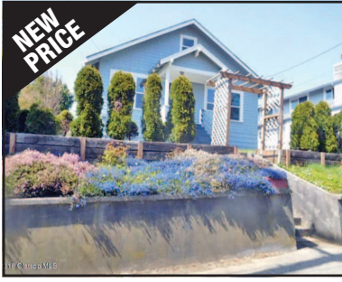
1477 7th St., Astoria $304,900