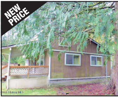
74196 Lost Creek Rd., Clatskanie $199,900