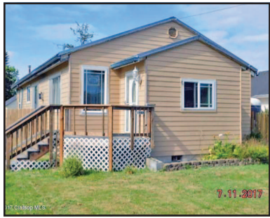
1095 Pacific Dr., Hammond $209,500