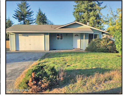
41957 Wickiup Terrace Ln., Astoria $225,000