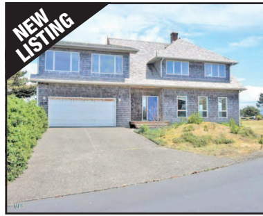
4545 High Ridge Rd., Gearhart $399,500