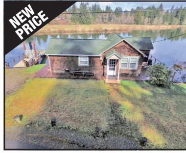
92035 John Day River Rd., Astoria $280,000