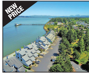
735 Point Triumph Condo #10, Hammond $365,000