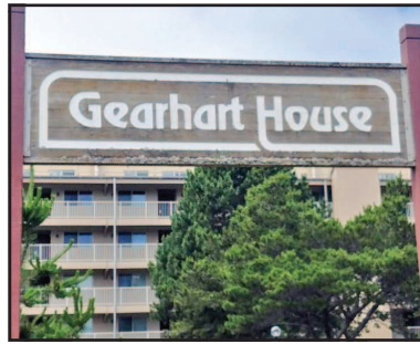
2-638 Gearhart House Condo, Gearhart $199,000