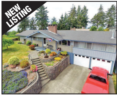
76 Skyline Ave., Astoria $485,000