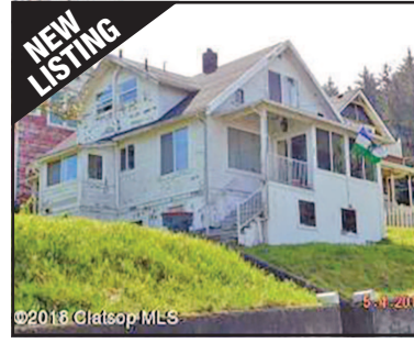
824 35th St., Astoria $255,000