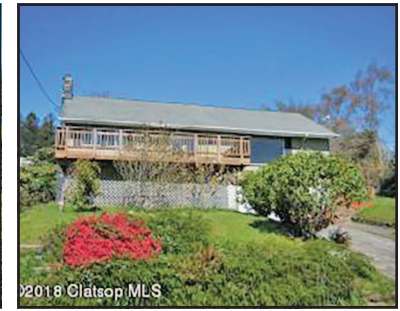
30 Auburn Ave., Astoria $325,000