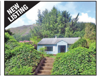
30210 Miami Foley Rd., Nehalem $89,900