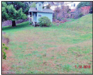
Below 794 33rd St., Astoria $55,000

A Tradition of Excellence, Trust and Service