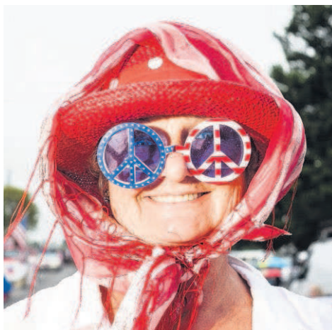
This member of the AARP chose to walk in the 2016 Long Beach parade in colorful eye-wear and a flamboyant hat.

“Owners can limit their pets’ exposure to anxiety triggers, like fireworks, by setting up a ‘quiet zone’ in their home if possible,” she said. “In some cases, giving a mild sedative before the fireworks start can be greatly beneficial. Every pet is a little bit different, so a consultation