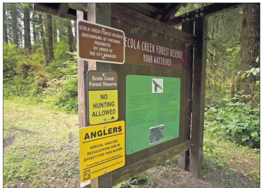
Signs at the reserve clearly indicate restrictions within the protected area.

Committee members are looking to a report on the state of the former logging roads in the area — left over from when the land was industrially harvested — to decide whether thinning projects are cost-effective.