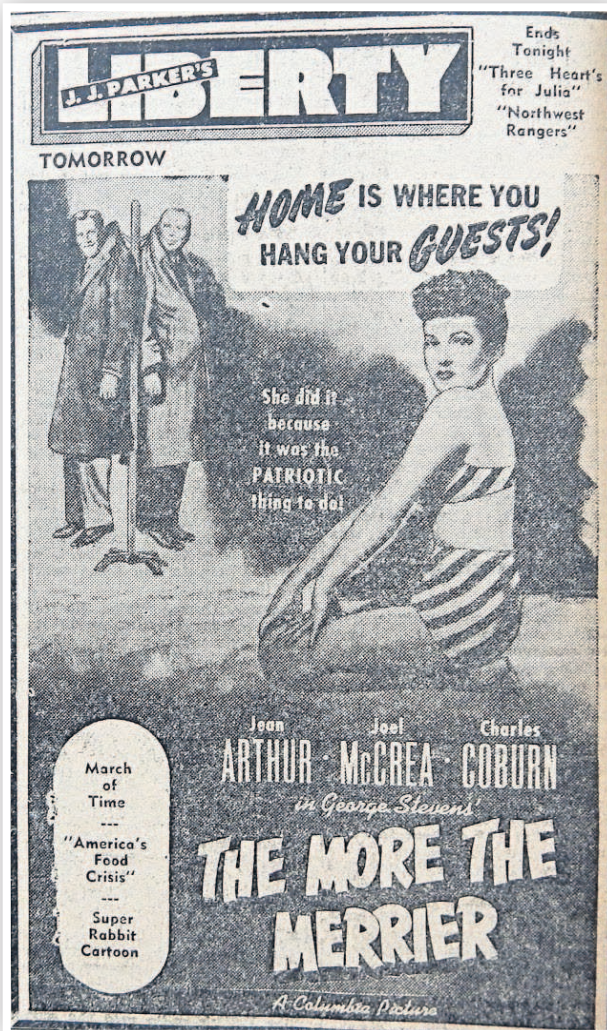
An advertisement from 1943.

Tapiola park was a seething mass of junior