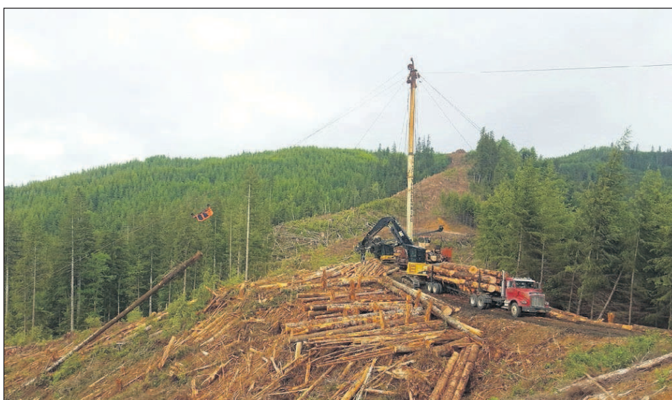
A Hampton logging operation in Clatsop County.

Sustainable timber harvest as a strategy to fight climate change makes a lot of sense when one looks at modern forest management and