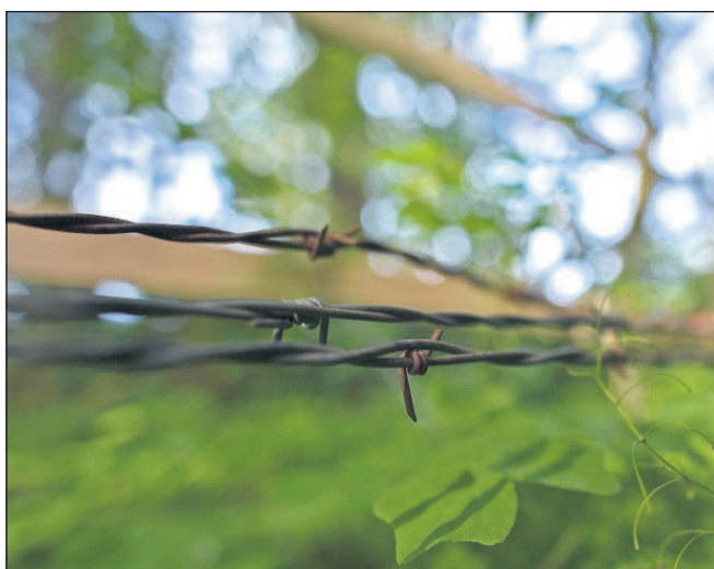
Lines of barbed wire run down the middle of the two fences.

Wildlife biologists hope the double-fence design will deter elk from trying to cross.