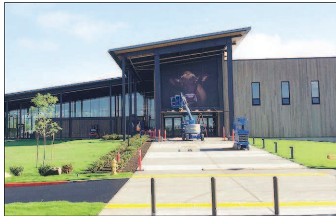
A new visitor center has opened at the Tillamook Creamery.

A larger dining area has more indoor seating and a spacious outdoor patio. There is an expanded ice cream counter and new coffee and yogurt bars. A revamped