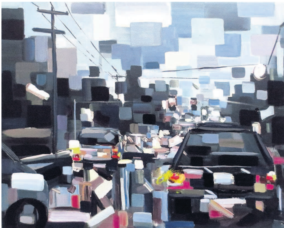
Brooke Borcharding’s ‘Night Traffic,’ at White Bird Gallery