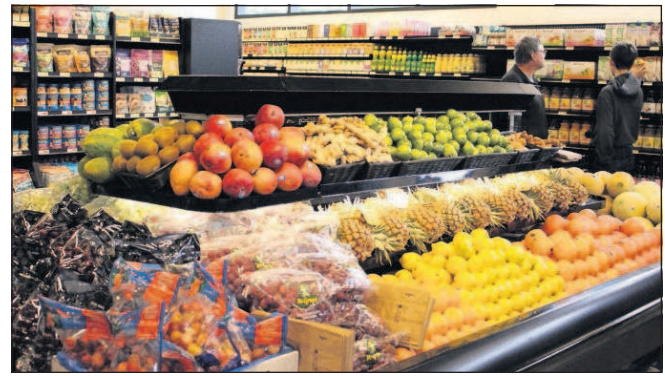
EO Media Group

A corporate-funded ballot measure that would block taxes on junk food and sugary drinks and freeze the state's corporate minimum tax for certain companies has qualified for the November ballot.