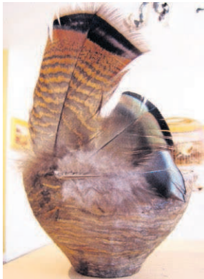
'Winged Ones,' on display at Tillamook Forest Center

To learn more about the workshop, or to explore upcoming naturalist-led programs, check out the Program & Events calendar at tillamookforestcenter.org .