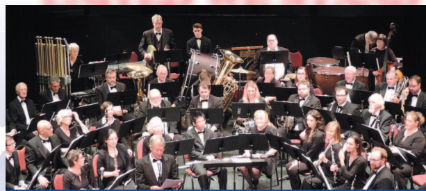
NORTH COAST SYMPHONIC BAND www.northcoastsymphonicband.org