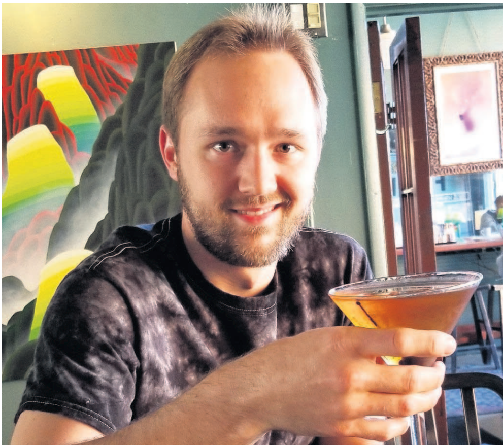
RYAN HUME PHOTOS