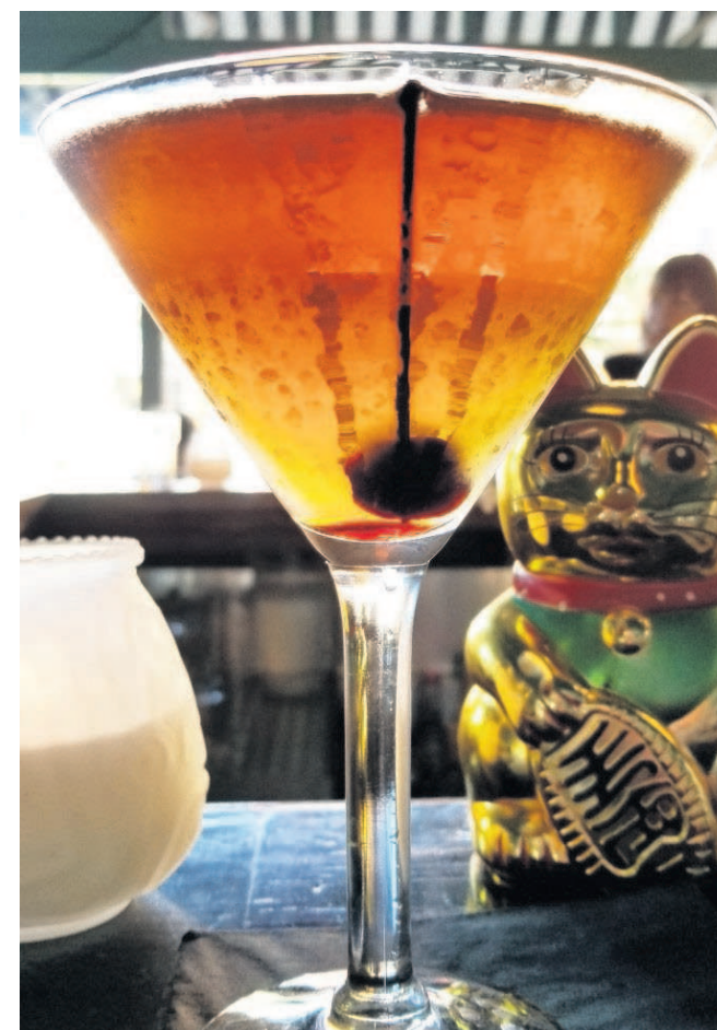
Black Walnut Manhattan