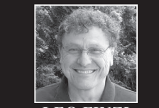
LEO FINZI Astorias Best.com

A: Many options exist to address this situation. Factors which determine the best option are patient interest, position of tooth, position of gum level, height and width of the bone, esthetic concerns and challenges, condition of adjacent teeth, and patient expectations. Available options to consider and discuss are doing nothing, fabrication of an economical removable "flipper", construction of a fixed bridge, and placement of a dental implant supporting an implant crown. The bridge and implant options are the most durable, esthetic and pleasing options to consider.