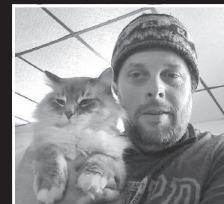
empty canvas media & design music, art, creative, logic

A: How a State handles "indigent deaths" is specific to statutes of that State's legislation. The State of Oregon does not have any public burial/cremation societies (as they used to exist historically in Europe or the early parts of the settling of the New World). Instead, our State has a special program that involves specific criteria which each funeral provider must investigate thoroughly before the state will qualify a decedent as indigent. Those funeral establishments who participate in the program truly live up to William Gladstone's quote: "Show me the manner in which a nation cares for its dead and I will measure with mathematical exactness the tender mercies of its people, their respect for the laws of the land and their loyalty to high ideals."