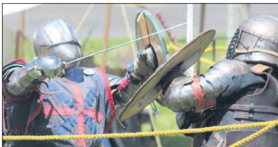
Two combatants go at it during a Viking battle demonstration.