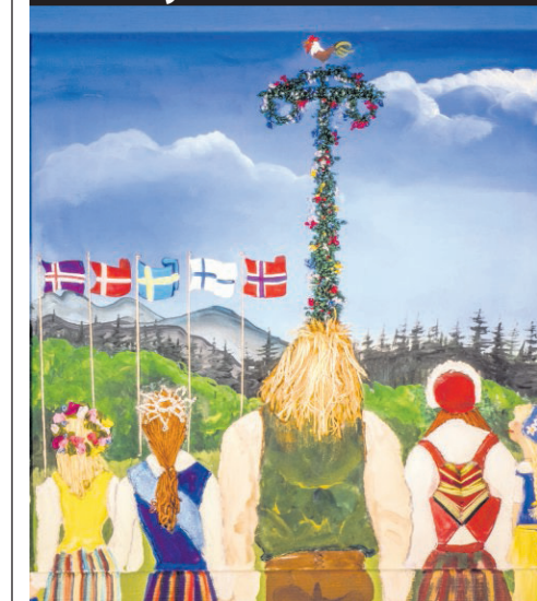
ASTORIA SCANDINAVIAN MIDSUMMER FESTIVAL 2018 ARTWORK