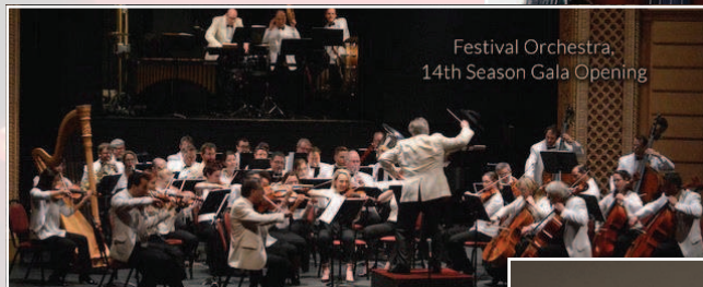
Festival Orchestra, 14th Season Gala Opening