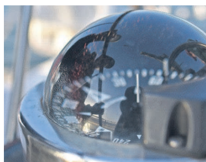
Curt Yoder is reflected in the glass dome encasing the boat's compass as he takes the helm.