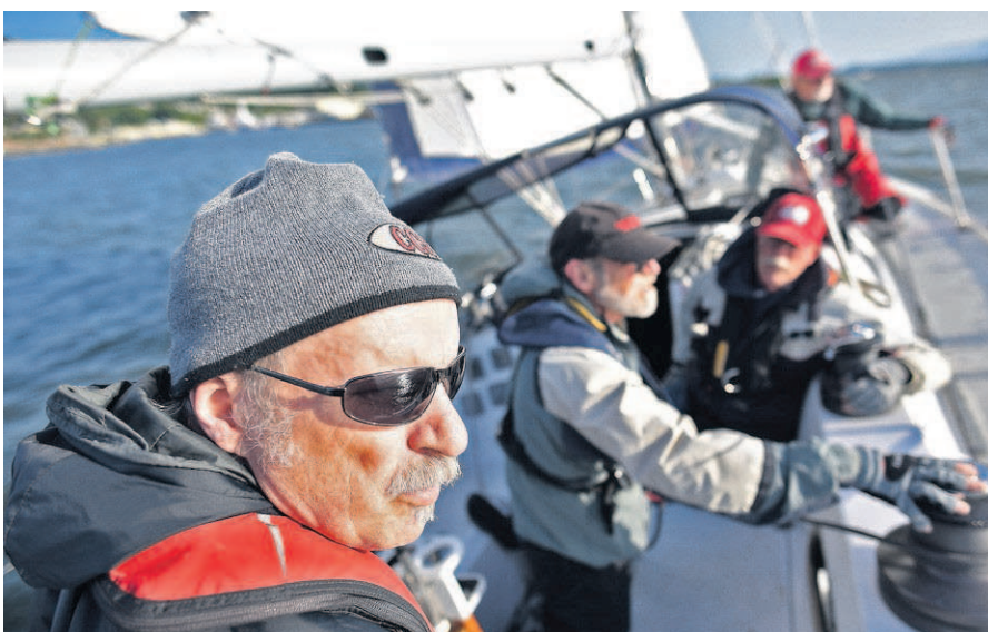
Crew members on board the S/V Contata compete in the first race of the season with the Astoria Yacht Club.

W hat do Astoria Yacht Club sailors do in the summer when the wind is good, the skies are clear and boats are ready? They race of course. If you are new to sailing and want to see what all the fuss is about, contact the yacht club — you might get lucky and land a spot on board a boat for a pleasure sail. Just remember to bring some wet weather gear, comfortable shoes and the Dramamine. And don't forget to duck if the captain informs you the boat is about to "jibe," because a really heavy boom is about to swing centimeters above your head at a high rate of speed. You don't want to be in the way.