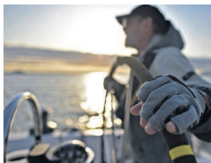
Curt Yoder pilots the Contata back into the marina after sailing on the Columbia River.