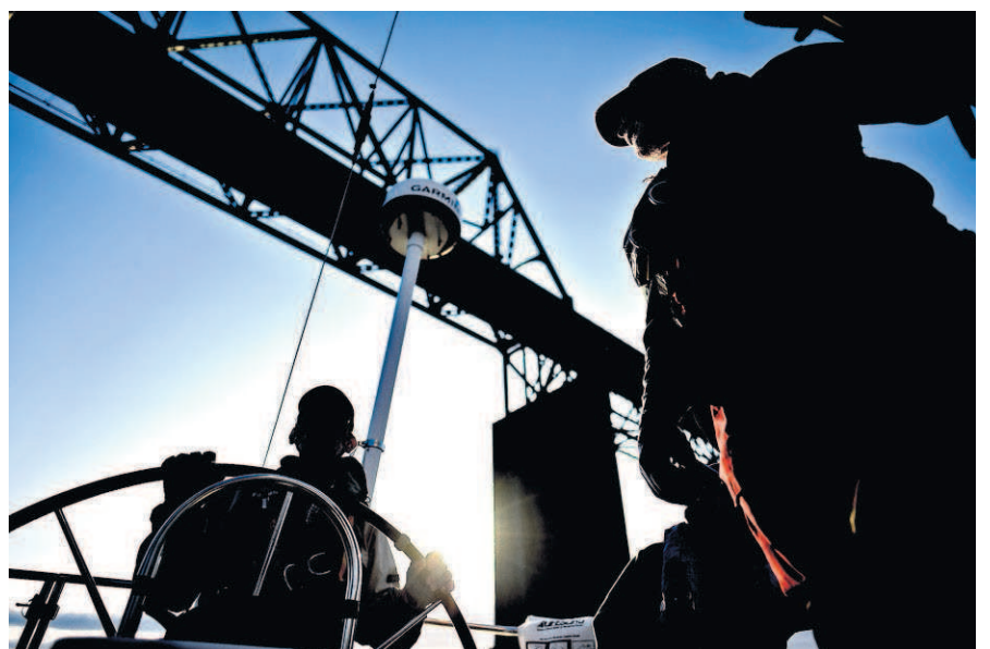
The S/V Contata sails under the Astoria Bridge during a race.