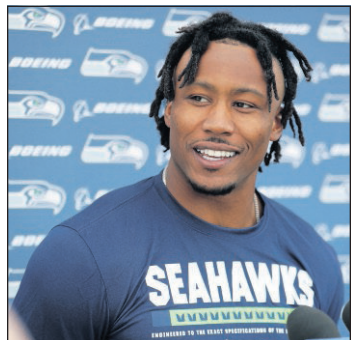
Seattle Seahawks wide receiver Brandon Marshall talks to reporters following NFL football practice Wednesday in Renton, Wash.

"I think the sentiment around the league is that I'm done. And I get it, rightfully so, when you get on the other side of 30 and your production slips and you have a big injury. People count you out," Marshall said. "It was an interesting process. It was a humbling process."